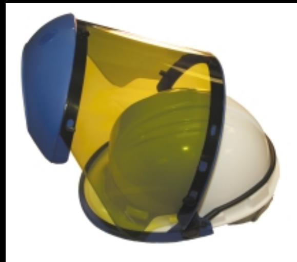
HF75 Helmet Frame Shown with SL712 and CHCP