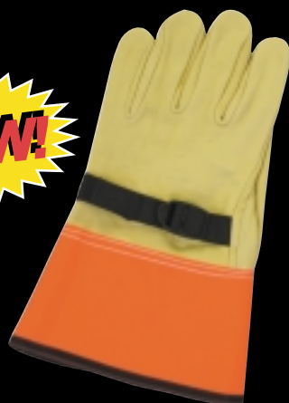
LCG12 Leather Cover Gloves