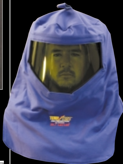
TT45712AF Hood with Fresh Air System

Employers must assess the potential hazard and determine the flash protection boundary distance. Stanco's Protective Clothing has been designed to meet standards, as outlined, for a particular Hazard-Risk Category with a minimum ATPV Rating of the value, noted in the Protective Clothing Characteristics section. It has been confirmed by OSHA that garments which meet the requirements of ASTM F1506 are in compliance with OSHA 29 CFR 1910.269 .