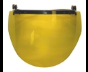
SL712 Shaded Windows