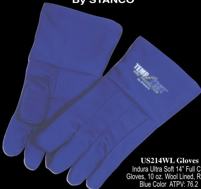
US214WL Gloves Indura Ultra Soft 14" Full Cut Gloves, 10 oz. Wool Lined, Royal Blue Color ATPV: 76.2