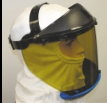
715CC Face Shield with Chin Cup and Ratched Headgear