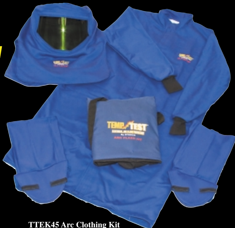
TTEK45 Arc Clothing Kit

All products available in: 11-cal, 20-cal, 35-cal, 45-cal, 59-cal, and 100-cal.