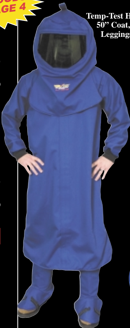
Temp-Test Hood, 50" Coat, and Leggings