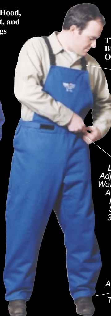
TT59-670 Bib Overalls