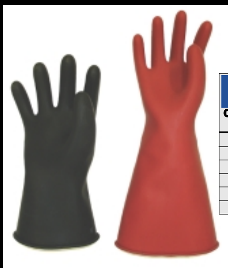
RLG0011 & RLG014 Rubber Insulated Gloves