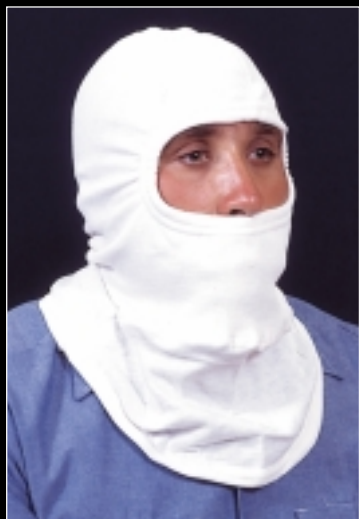
NXL778 Nomex/Lenzing Double Knit Hood