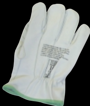
LCG10LV Low Voltage Gloves