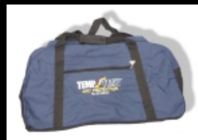
GB50 Gear Bag

US7411 Indura Ultra Soft Shirt and US9511 Indura Ultra Soft Pants