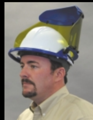
715CCS Face Shield with Chin Cup and Slotted Headgear