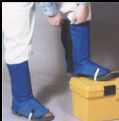
TT5925VC 15" Leggings

Call your Stanco Customer Service Representative if you have questions: 1-800-348-1148.